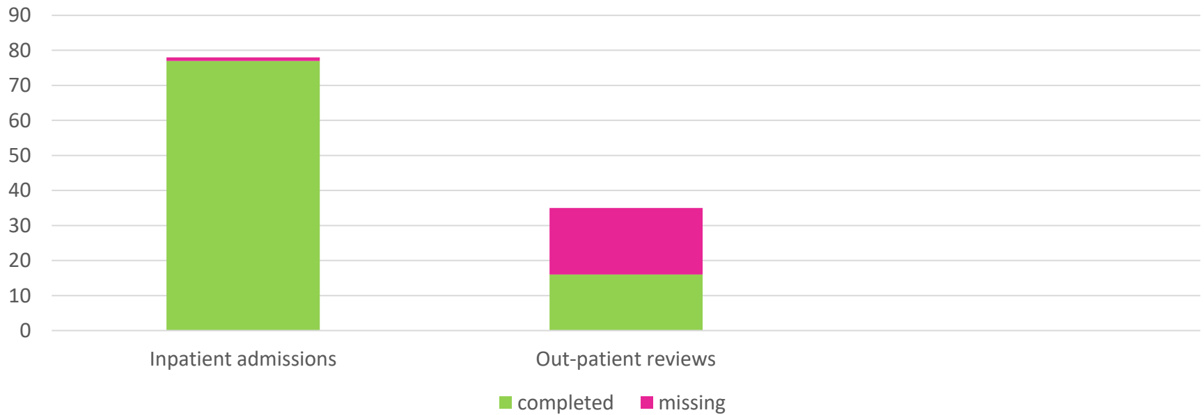
Inpatient vs Out-patient completion rate